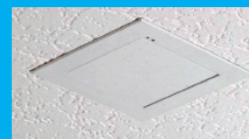
Interno LED - not in Emergency Mode